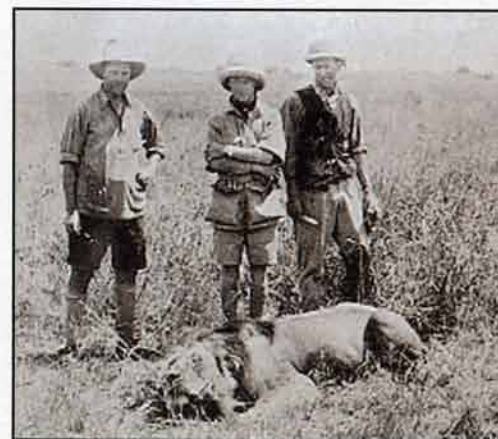
Denys Finch Hatton and companions after the kill